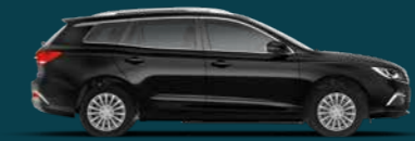
BLACK PEARL metallic paint