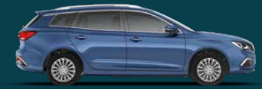
PICCADILLY BLUE metallic paint