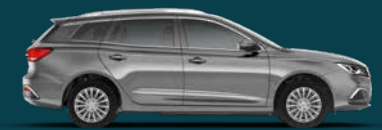
WESTMINSTER SILVER metallic paint