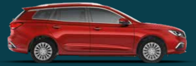
DYNAMIC RED tri-coat paint

Tri-Coat and metallic paint optional at extra cost.